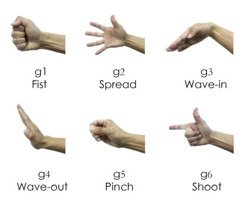
Figure 1: Example of customizable gestures that can be used on the gForcePro+ [1]

Our software is going to try to offer an improved human-computer interactive experience by integrating devices that record and analyze data wirelessly, efficiently and in real time. Our software is going to use special equipment that we recently acquired, which includes a sensor for eye tracking and eye control, and two armbands that record the signal from the muscles. The Tobii Eye Tracker 5 is a 13-inch sensor that has to be attached at the bottom of a screen or a monitor and it gets connected to the computer by a USB cable. It tracks head and eye movements and generates a stream of data that is later decoded and interpreted by the desktop application. The way we are going to interact with this device is by accessing the data stream and decode it ourselves through its API and then later assign specific rules or events according to the type of movement or action executed by the user. The gForcePro+ is an armband that uses Electromyography (EMG), which is a technique for recording and evaluating electrical activity produced by skeletal muscles, and produces real time signals that can be further processed. The armband supports up to 16 different customizable gestures. The only limitation on the gestures you can use is that they must produce distinct EMG signals.